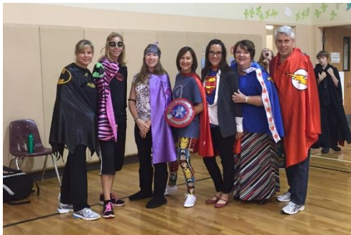
Staff during spirit week!