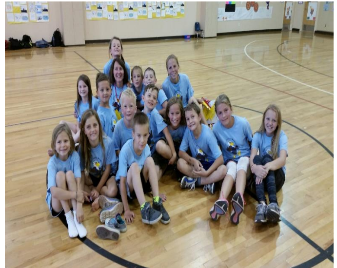
2 nd - 5 th grade resting before the BBQ

Only $2380.85 to 100% of goal!! That calculates to $42.52 per family, 10, $4 coffees or $2.13 per day. All pledge $ must be received by Friday, 11/13/15, to count towards prizes!! 100% of goal=ALL SCA ICE SKATING PARTY!!